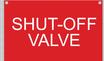
Nameplate Size: 2.5 x 4 in 1/2 inch text size (sized to fit also available)

These images are for approximate representation only.