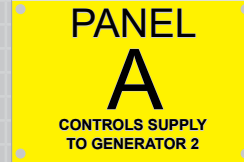
Nameplate Size: 2 x 3 in Row one - 3/8 inch text size Row two - 3/4 inch text size Row three & four - 3/16 inch text size